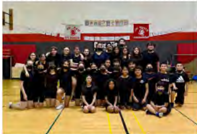
The 2022 St. Bartholomew School Dance Troupe

¿Su hijo/a tendrá 5 años antes del 1 de septiembre de 2022? Si es así, su hijo/a es elegible para comenzar Kindergarten.