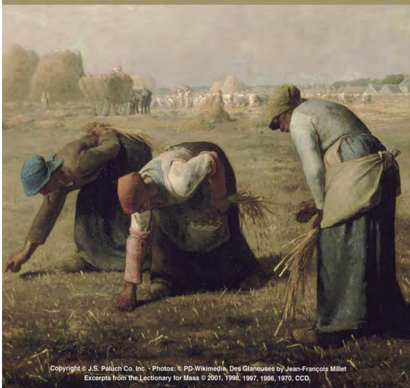
Copyright © J.S. Paluch Co. Inc. • Photos: © PD-Wikimedia, Des Glaneuses by Jean-François Millet Excerpts from the Lectionary for Mass © 2001, 1998, 1997, 1986, 1970, CCD.

Behold, the wages you withheld from the workers who harvested your fields are crying aloud; and the cries of the harvesters have reached the ears of the Lord of hosts.