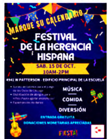
St. Bartholomew School's Hispanic Heritage Festival!