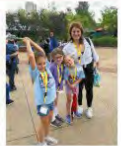
Lincoln Park Zoo Field Trip