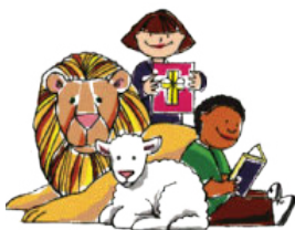
Children's Liturgy of the Word

To all Parishioners of Saint Pascal Church,