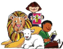
Children's Liturgy of the Word

Articles for the December 31 bulletin must be submitted by Thursday, December 21.